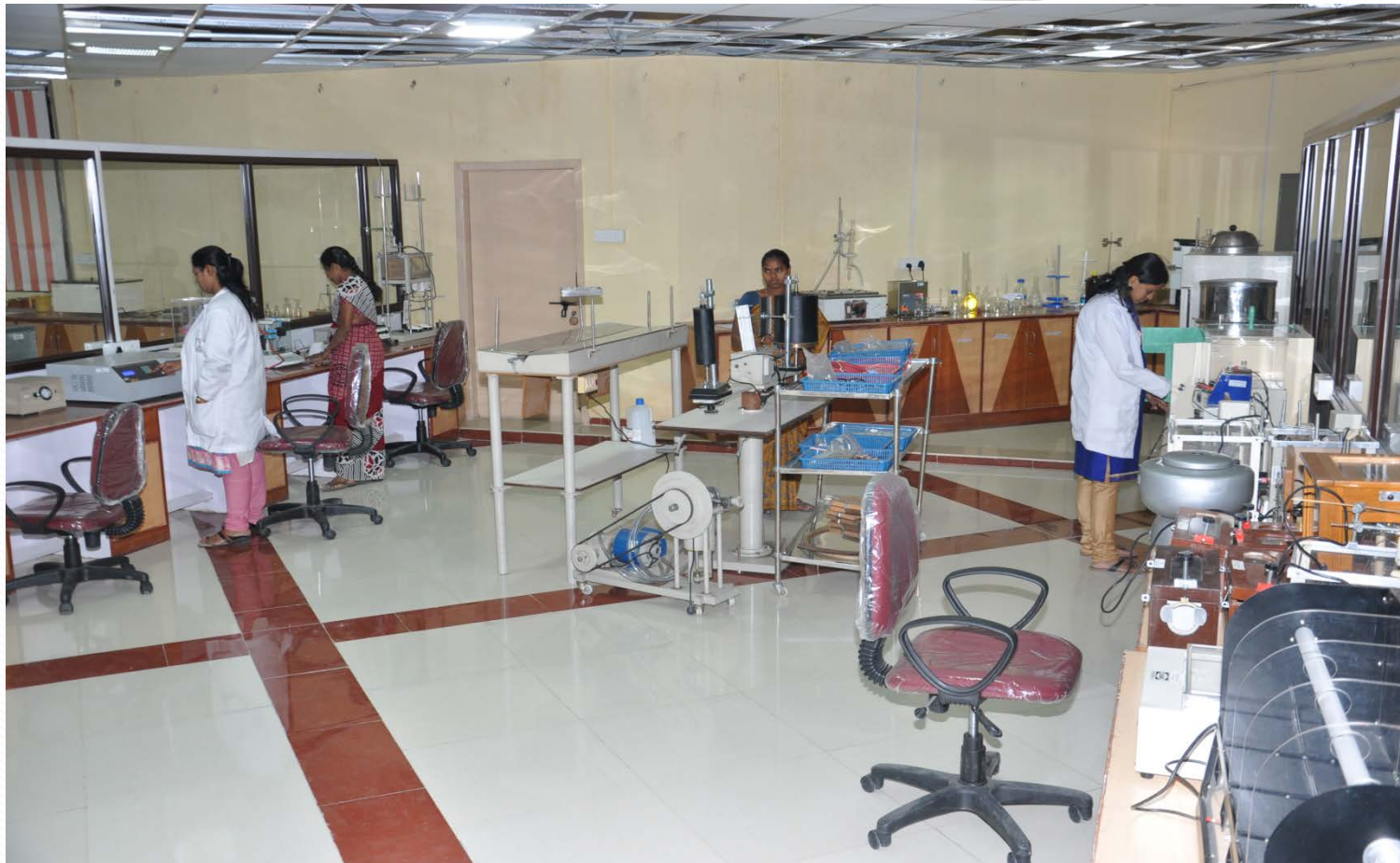
RRMCH – Central Research Lab