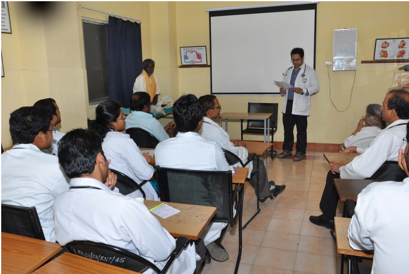
Department of General Medicine – P G Clinical Seminar