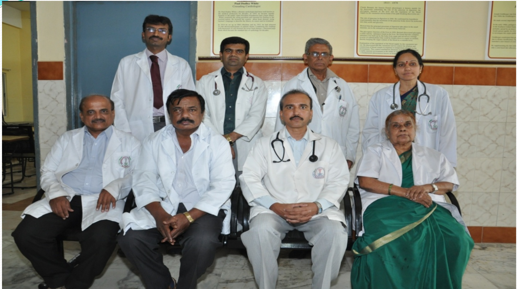
Department of General Medicine – Senior Faculty