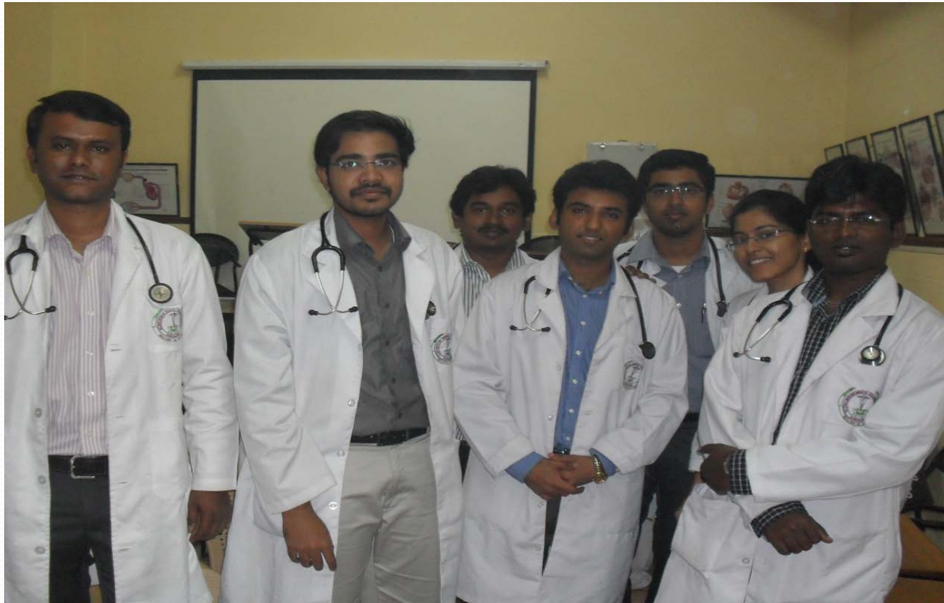
Department of General Medicine – Post Graduates